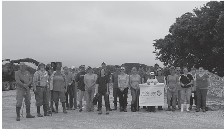
Thank you to our wonderful CBES and TNC volunteers for another job well done!