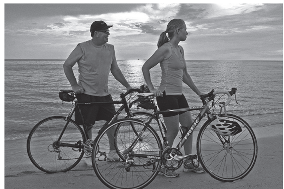
It’s summer, but now’s the time to register for the 2016 Between the Waters Bike Tour.