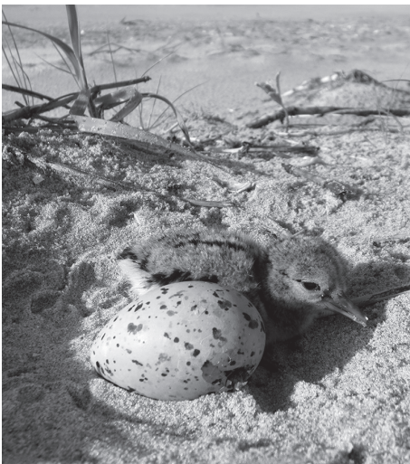
American oystercatcher egg and chick.