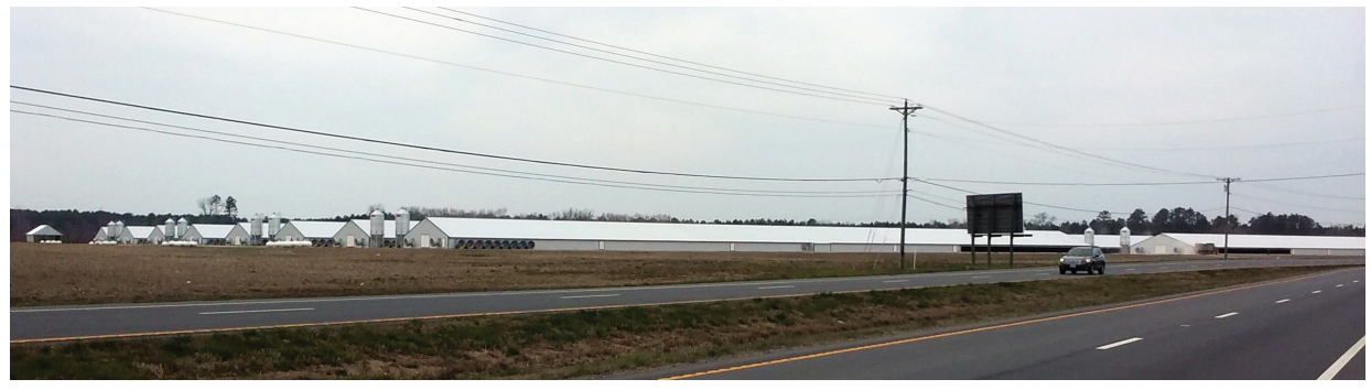
New 16-house CAFO on Route 13 north of Parksley