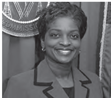
Keynote speaker Mignon L. Clyburn

Tickets are $6 for adults, no charge for students