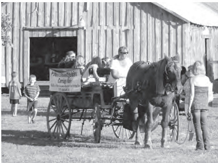
Pig Roast attendees took wagon rides thanks to Pfeiffer Stables.