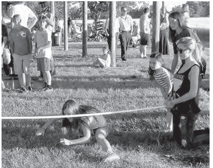
Limbo remained a popular activity at the Pig Roast.

Detach and return to CBES, PO Box 882, Eastville, VA 23347 • Join online at www.cbes.org